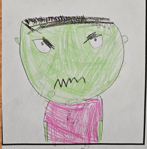
I feel cranky when I cont